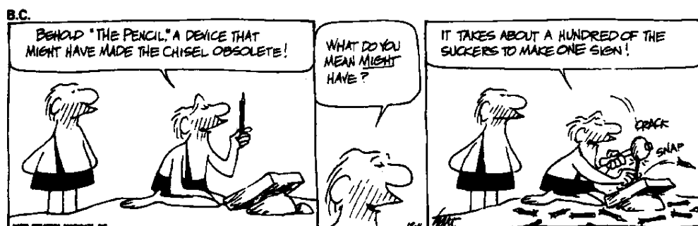
Figure 1.1 B.C. Comic Strip

flexible and dynamic curriculum by taking into account new teaching methods that were made possible by technology (Ministry of Education, 2003). This was a different approach from the current practice of using IT to support an existing curriculum. The mp2 would also seek to change the current predominant pedagogy of a teacher-centred use of IT to a more pupil-centred strategy for learning.